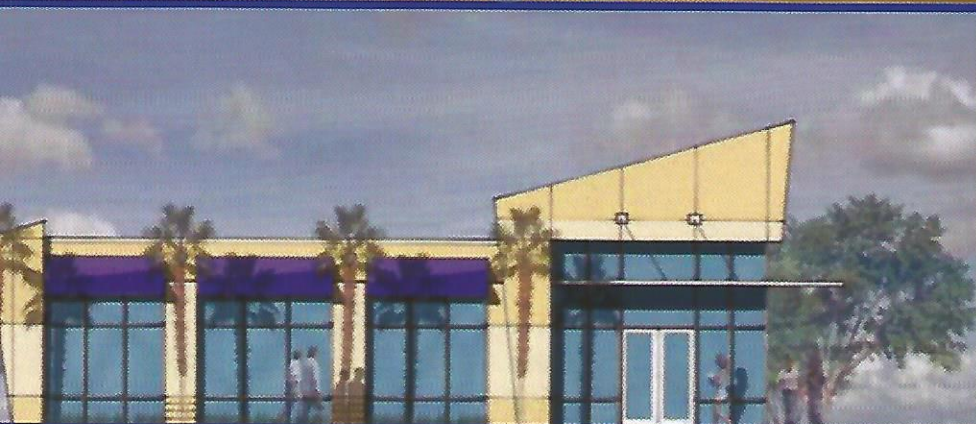
Used for illustration purposes only.

Artistas Café, Artistas Palate, Artistas Gallery & Unique Gifts, Artistas Fulfilment, Artistas Medical Center